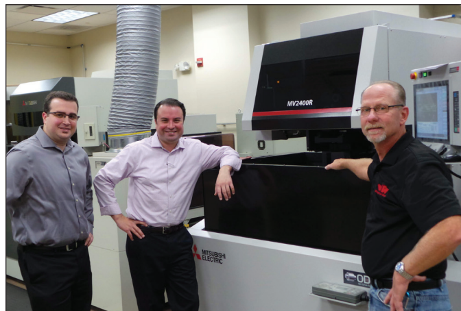
Wiegel Tool Works

New tools are allowing companies to create and test situations in the virtual world, to simulate the design process