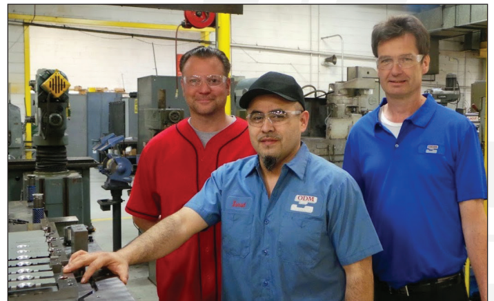
ODM Tool & Mfg.

Welcome to Industry 4.0 – we're nearly there.